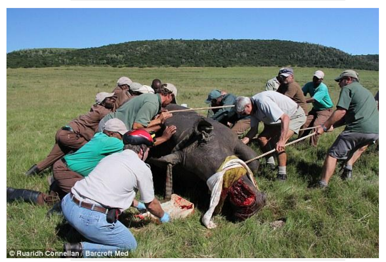
Grumpy: A team attempt to roll a rhino after the dentist removes an infected horn in Pretoria