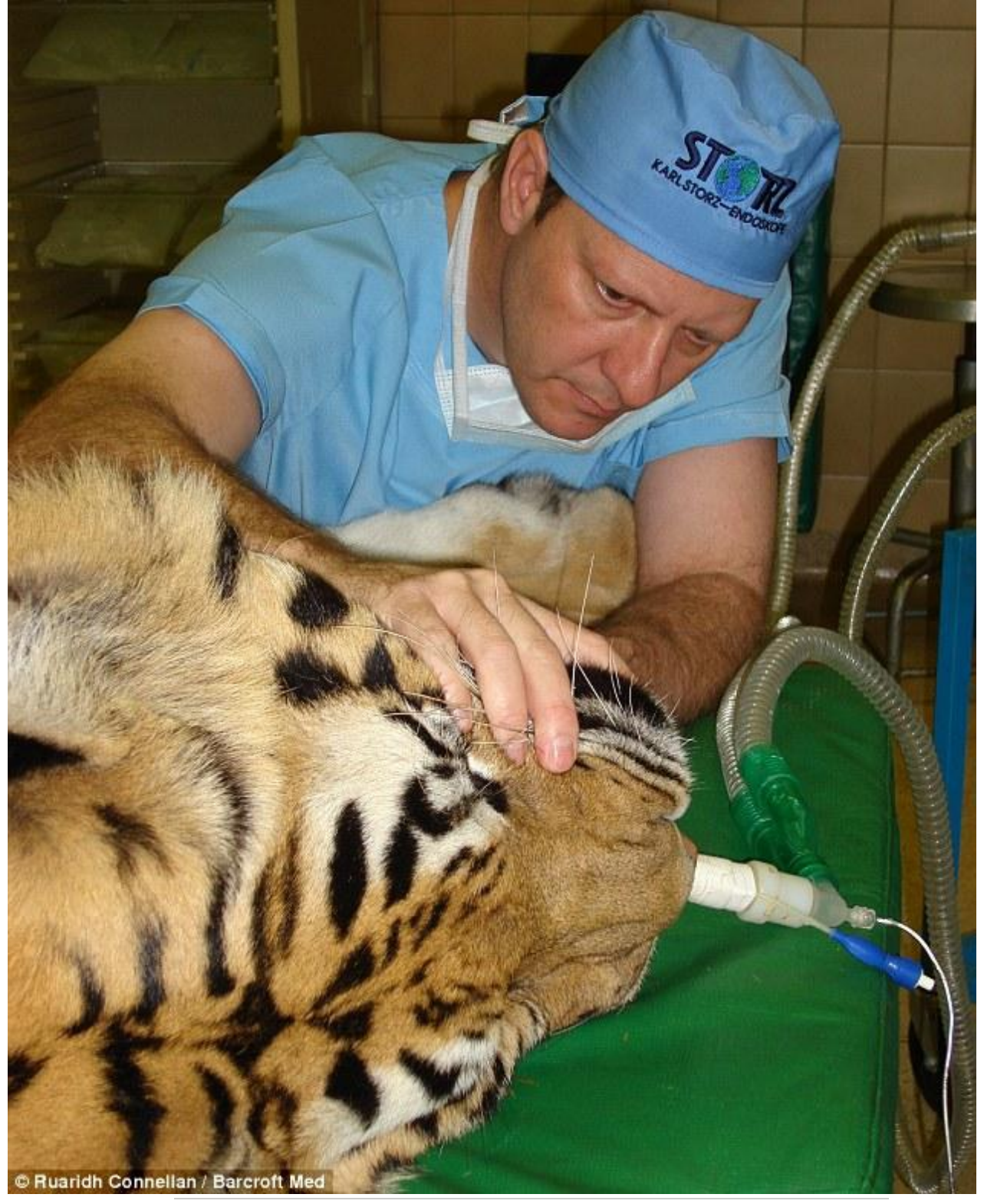
Ferocious: Although dentists often have to deal with grumpy patients, its doubtful many can be as hot-tempered as this tiger