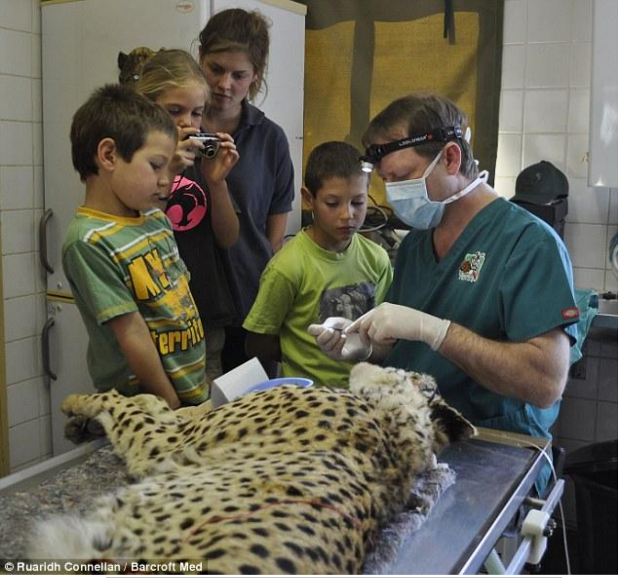
Fascinated: Schoolchildren watch at the talented dentist operates on a cheetah