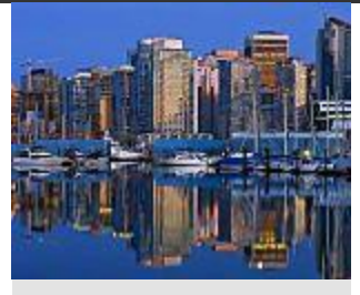
25 Best Cities For Young People To Live In Clamorly