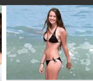
Hilarious Fail Gifs! (17 Gifs) Funlyest