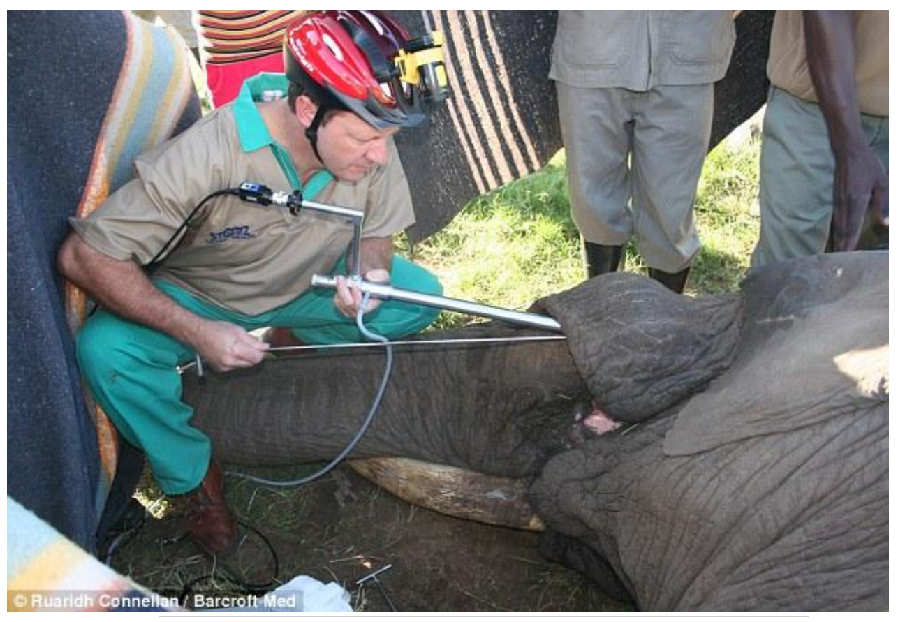
Surgery: This elephant has some emergency repair work carried out on its teeth