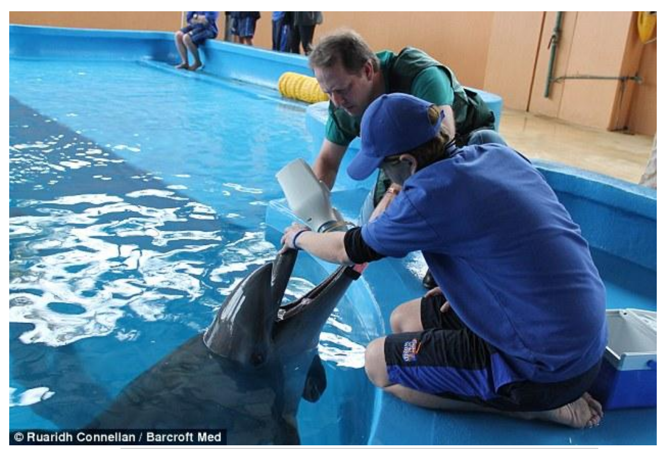
Tricky: The most common complaints from his animal patents are fractures of teeth, infections and abscesses. He is pictured checking a dolphin's teeth