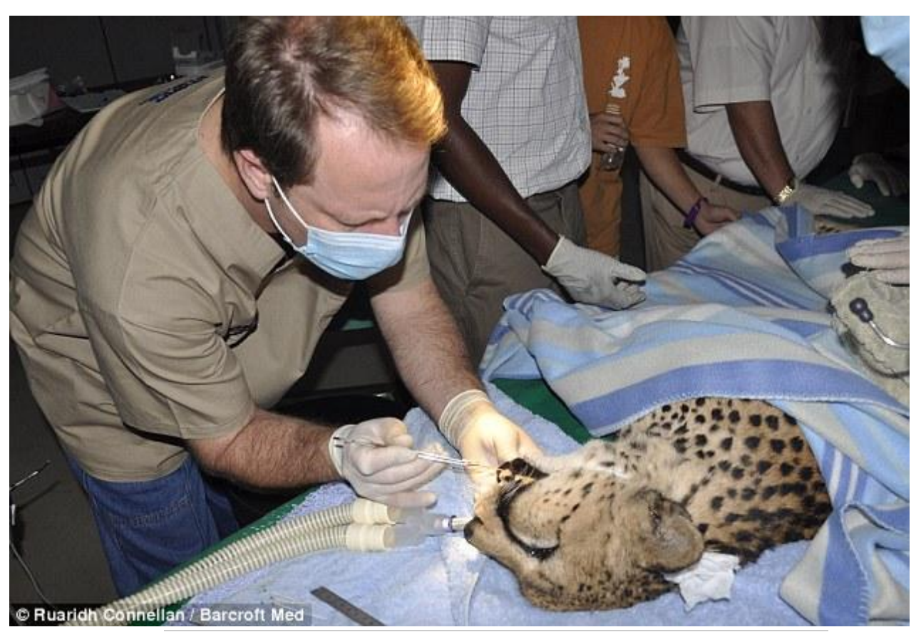
Multi-talented: The dentist performs a host of procedures including root canals, extracting teeth and scaling and polishing teeth. He can be seen operating on a cheetah

'The majority of the big animals like buffalo, hippo, rhino, elephants, they're just so big and enormous it can be tricky.